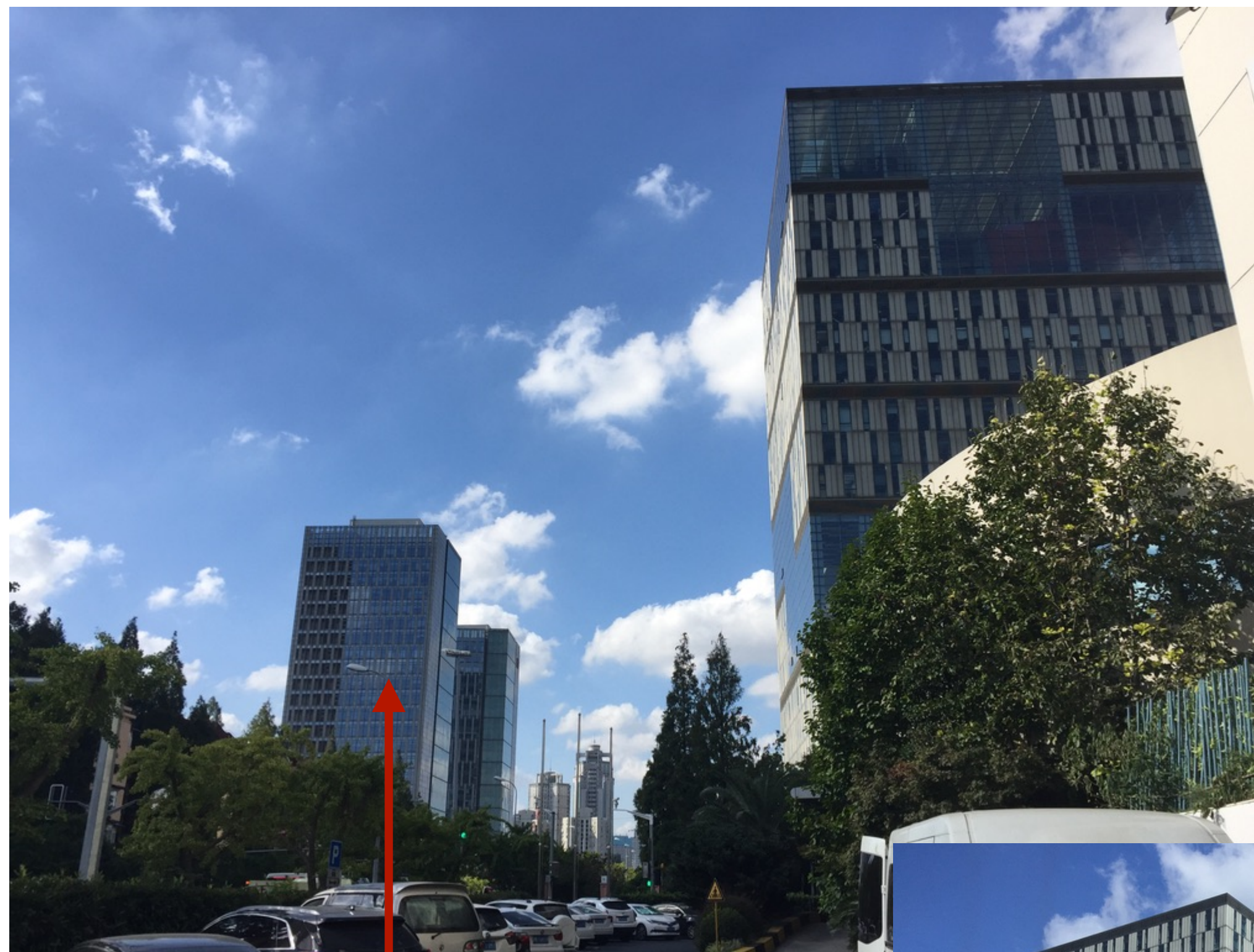
Bâtiment de cours